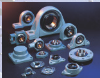
Ball bearing housing units for shaft diameters 12-120 mm