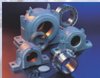
Split plummer block housings made from grey cast iron, ductile iron and cast steel