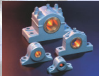
Grease lubricated plain bearings with bronze bushes

All housings of our product program can be coated with SSP. Please contact us.