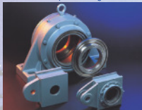
Plummer block and take-up units for conveyor systems of all sizes

HFB Wälzlager-Gehäusetechnik GmbH Siemensstr. 33 · 74722 Buchen · Germany Telefon: +49 (0) 62 81-52 66-0 Fax: +49 (0) 62 81-52 66-33 e-mail: info@hfb-waelzlager.de www.hfb-waelzlager.de