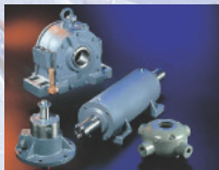
Oil and grease lubricated housings for fan-industry